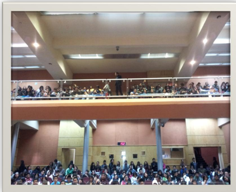
Attendees pack a room at the 2 nd Actuarial Congress recently held by the National University of Mexico.

Mexico —In commemoration of the 300 th anniversary of Bernoulli's masterwork "Ars Conjectandi" and as part of the celebration of Estadística2013 (Statistics2013), the Actuarial Faculty at the National University of Mexico (UNAM) hosted the 2 nd Actuarial Congress January 21 to 24. More than 300 students attended the different conferences and discussion groups. Learn more.